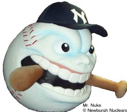
Mr. Nuke

I'd like to thank the good Lord for making me a Yankee – Joe Di Maggio